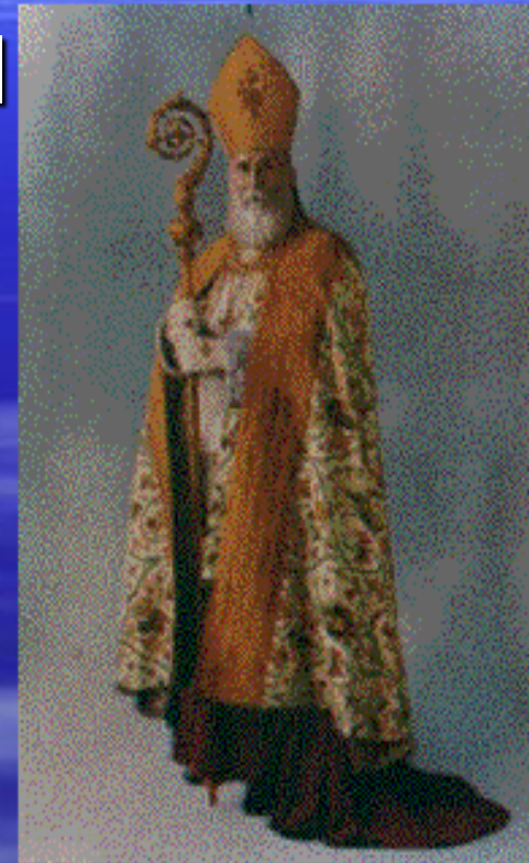
Bishop Charles Leadbeater Liberal Catholic Church (1854-1934)